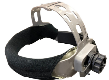
5-Point Adjustable Head Gear