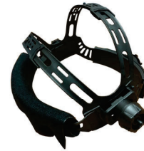
6-Point Adjustable Head Gear