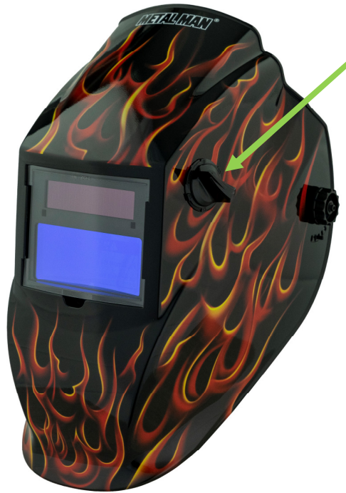
Shade Control 9-13 Plus Grind