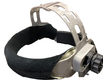
5-Point Adjustable Head Gear