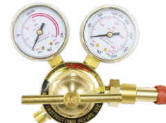
BS250I510 250 Series Acetylene Regulator CGA-510