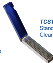
TCSTDI Standard Tip Cleaner