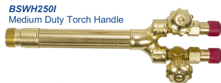
BSWH250I Medium Duty Torch Handle