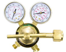
BS250I540 250 Series Oxygen Regulator CGA-540