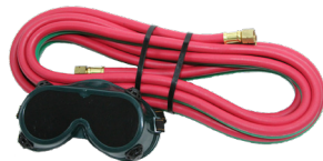
Blue Star Standard Goggles and 12' x 1/4" R-Grade twin hose