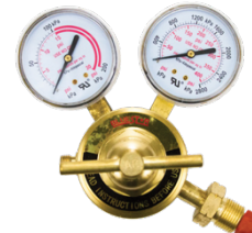
BS350I510 350 Series Acetylene Regulator CGA-510