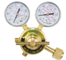
BS350I540 350 Series Oxygen Regulator CGA-540